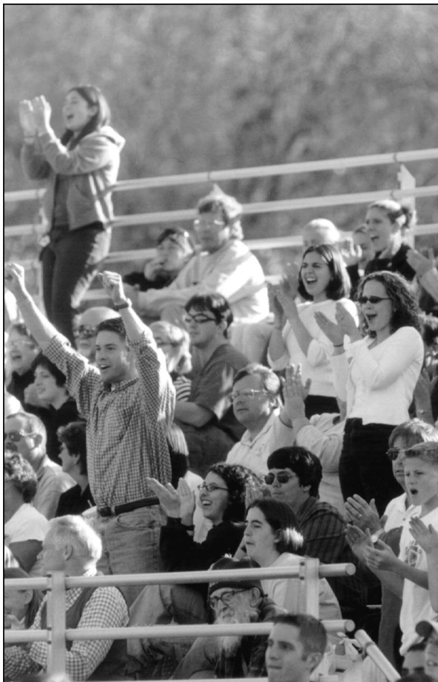
Students, families, and members of the Etown community enjoy the strong Division III athletic traditions of the Blue Jays.